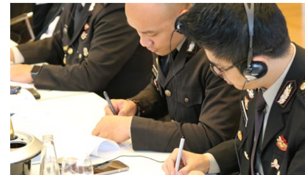
In cooperation with the Bavarian police the HSS promotes the principles of a service and people-oriented police force