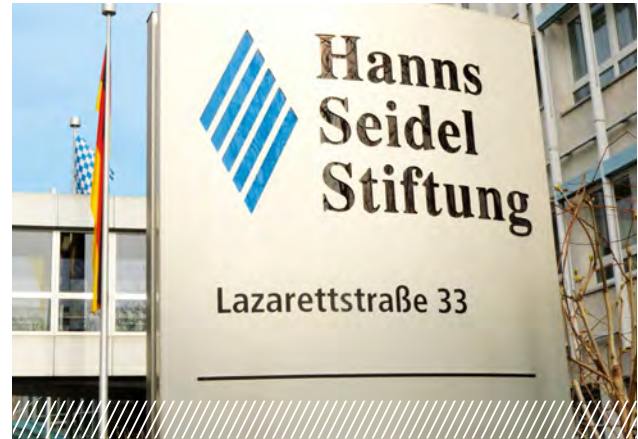
Foundation Headquarters, Munich