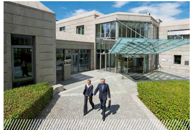
Munich Conference Centre