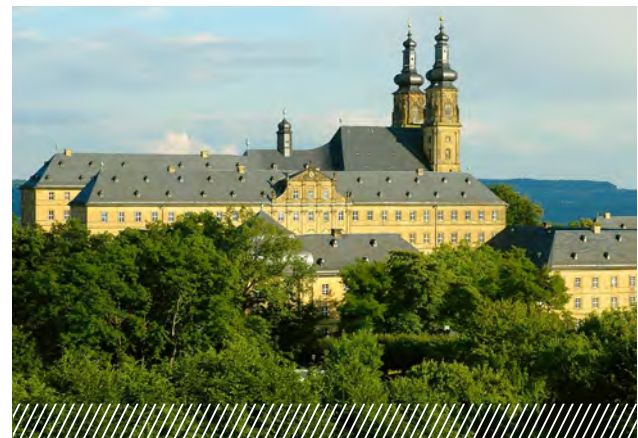
Kloster Banz Educational Centre (former monastery)