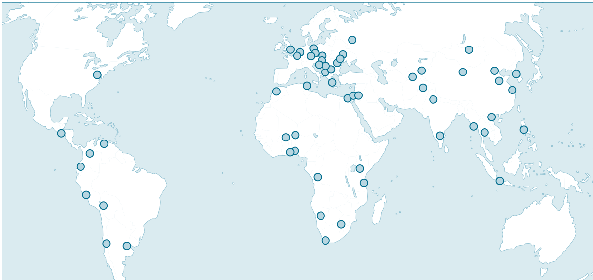
● Hanns Seidel Foundation Agencies

Today, the Hanns Seidel Foundation is involved in educational projects in Germany and over 50 other countries around the world. The CSU-affiliated foundation's slogan is “In the Service of Democracy, Peace, and Development” .