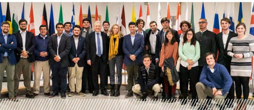
Delegation from Chile on "The EU institutions and current developments in the EU" visiting Brussels