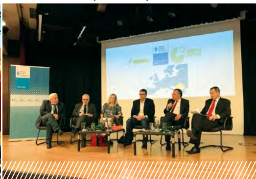
German-Greek Symposium in Athens on security and stability in the Balkans