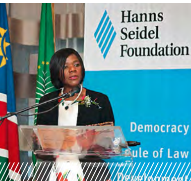
South African Ombudswoman Thulisile Madonsela