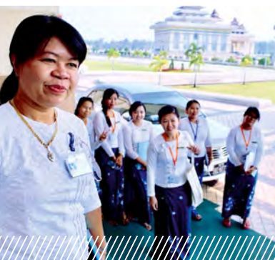
Supporting a more people-oriented parliament in Myanmar – A visitor service has been developed