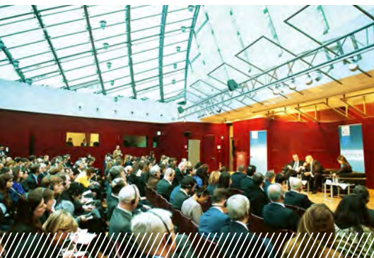
Panel discussion in Brussels on the role of the Balkans