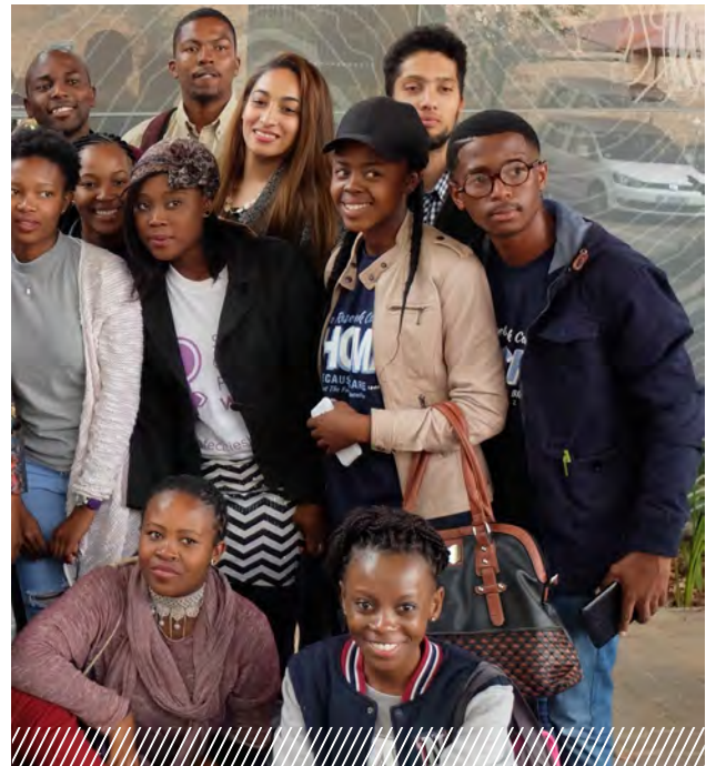
Civics Academy Youth Dialogue participants at the Nelson Mandela Foundation in South Africa