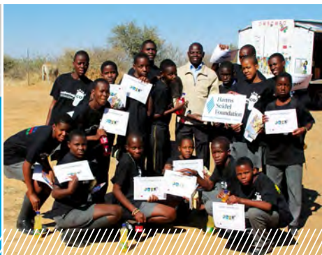
Participants at a conference on renewable energy in Namibia