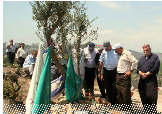
Promotion of ecological sustainability and environmental awareness

The European Office in Brussels manages the development policy dialogue with the responsible European Union contacts. European development cooperation is discussed in dialogue forums and specialist conferences. These events form a platform to point out approaches for cooperation and thus help shape European policy. A key factor here is sustainable networking of our project partners with EU experts. We continue the dialogue with the public and decision-makers in politics and science in Munich through the publication series of "Arguments and materials of development cooperation" and "Development Policy Forum" events.