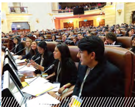
Insight into the work of the parliament in Colombia